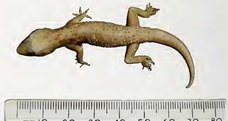
Fig. 11. Hemidactylus angulatus / guineensis complex: lectotype of Hemidactylus stellatus Boulenger, 1885.

Steindachner (1870) described H. affinis from Gorée and Dagana, Senegal, and diagnosed it also only against H. verruculatus (= H. turcicus ). He stressed the similarity of these two species, particularly concerning the size of their strongly keeled tubercles. The type series of H. affinis closely resembles the savannah-dwelling H. guineensis . In his description of H. stellatus , Boulenger (1885) compared it with H. brookii and H. gleadowii and stressed the presence of pure-white tubercles intermixed with a majority of dark brown ones which inspired him to the name stellatus (= starred). These white tubercles are indeed more obvious in the savannah-dwelling form (Figure 11) and